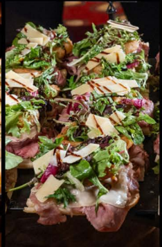
Prime Rib Focaccia Bread