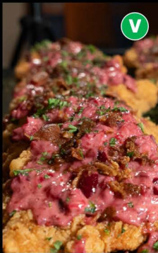
Crispy Chicken Cutlets w/Cranberry-Butter Sauce