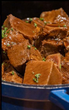
Beef Pot Roast