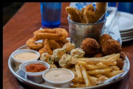
BIG BITES PLATTER